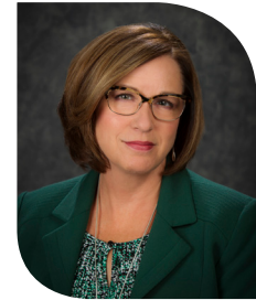
Orange County District 1 Commissioner: Betsy VanderLey